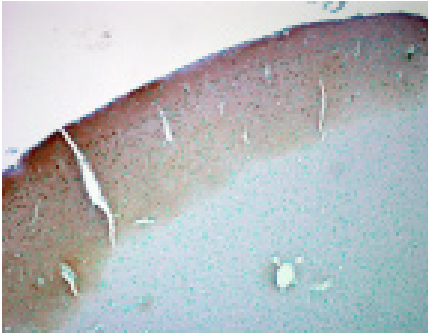
Anti-CaMKII visualized in colon cancer tissues, shown at a 1:10,000 dilution of SKC-220 using the ABC method.